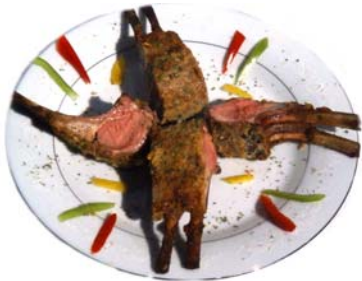
Herb Crusted Baby Lamb Chops