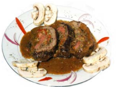
Mediterranean Stuffed Sirloin