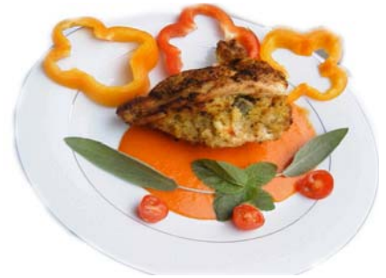
Cornbread & Okra Stuffed Cajun Chicken