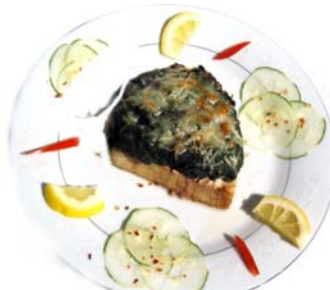
Swordfish Rockafeller with Spinach Gorgonzola sauce