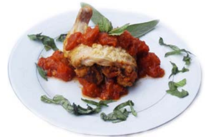
Eggplant Parmesan Stuffed Chicken Breast