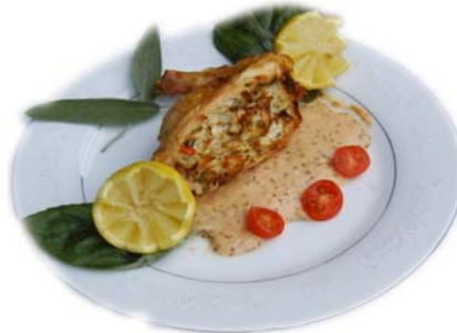
Crab Stuffed Chicken with Sauce Remoulade