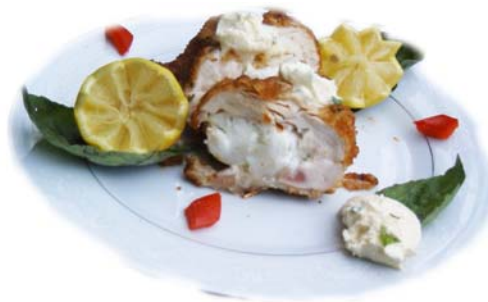
Lobster Stuffed Chicken