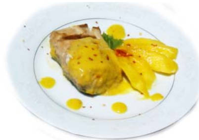
Mahi with Saffron Sauce