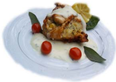
Couscous Stuffed Chicken with Lemon Caper Sauce