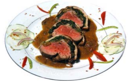
Veal Wrapped Beef Tenderloin