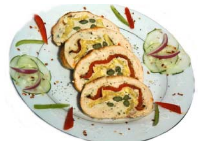
Roasted Red Pepper & Aspara- gus Stuffed Breast of Chicken