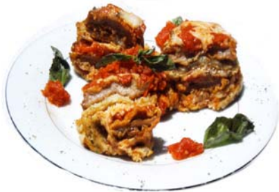
Veal & Eggplant Napoleon